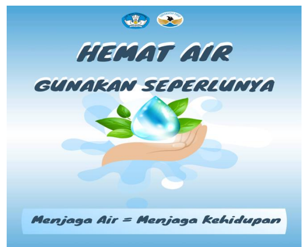
Figure 5. Poster of Using Water Wisely

Please use water wisely and turn off taps after use