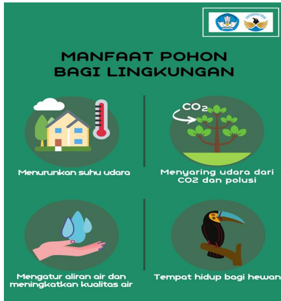
Figure 6. Poster of Benefits of trees for the Environment

Please do not cut trees around the Elo River during the rafting activity