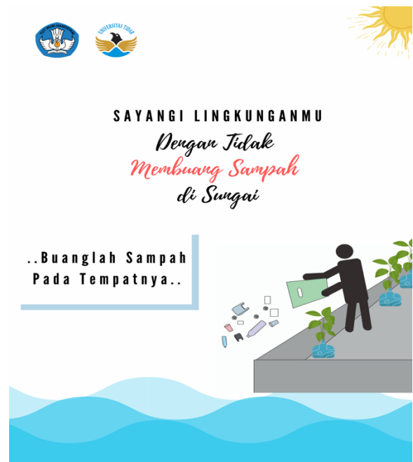
Figure 4. Poster of Suggestion to throw garbage in its places

Please throw the garbage in its places during rafting activity and while you take a break