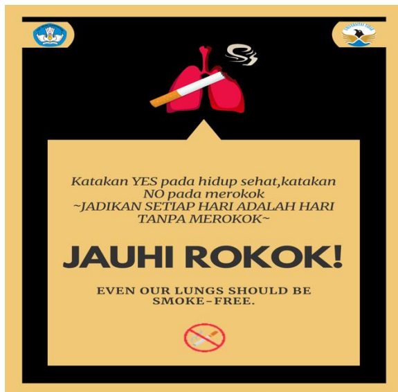
Figure 3. No Smoking Poster

“Bapak Ibu selama pelaksanaan arung jeram dimohon untuk tidak merokok” Please, do not smoke during rafting activity