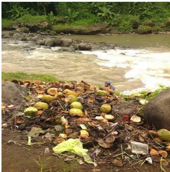
Figure 2. A portrait of garbage by the Elo River

The Elo River rafting activity is an activity using an inflatable raft. The activity depends on beautiful and environmentally-friendly environment. A depict of one of the Elo River rafting environments could be seen in Figure 2.