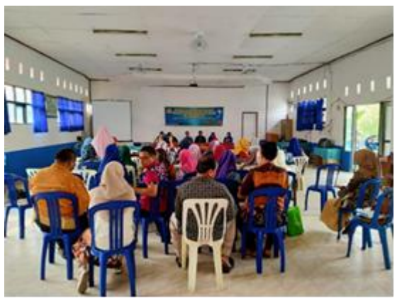
Fig 1. Training and Assistance in Preparing Class Action Research Proposals

The training and assistance in preparing class action research proposals for science teachers in Hulu Sungai Tengah District aims to improve the understanding and ability of classroom action research teachers in Hulu Sungai Tengah Regency regarding classroom action research. Actions that are considered appropriate to overcome the problem of the difficulties of classroom action research teachers in preparing class action research proposals are to provide classroom action research training that meets the needs of the teacher, actively involve the teacher in planning, implementing, and assessing the results of the training, and assisting intensively these teachers were able to compile or produce class action research proposals well. Implementation of training and assistance in preparing class action research proposals attended by science teachers in the Hulu Sungai Tengah Regency, including SMPN 1 Hulu Sungai Tengah , SMPN 2 Hulu Sungai Tengah , SMPN 3 Hulu Sungai Tengah , SMPN 6 Hulu Sungai Tengah , SMPN 7 Hulu Sungai Tengah, SMPN 8 Hulu Sungai Tengah , SMPN 11 Hulu Sungai Tengah , SMPN 12 Hulu Sungai Tengah, SMPN 13 Hulu Sungai Tengah, SMPN 14 Hulu Sungai Tengah , SMPN 16 Hulu Sungai Tengah , SMPN 17 Hulu Sungai Tengah, and others.